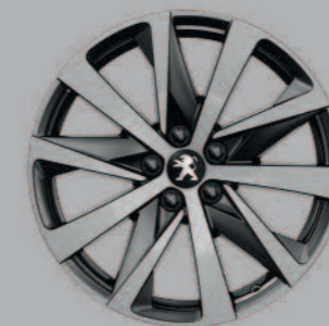
18" HIRONE diamond cut two tone