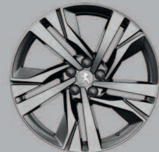
19" AUGUSTA diamond two cut tone