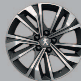
17" MERION diamond cut two tone